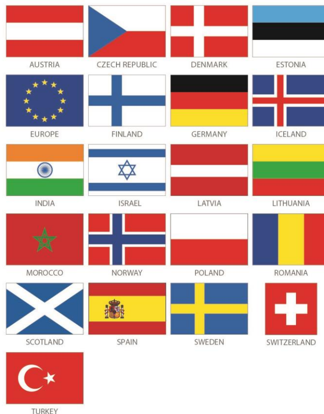
Fig. 1: Joint Call 2020 digital transformation for green energy transition (MICall20) partners

The countries and regions participating in the Joint Call 2020 consists of a subset of national and regional funding partners from the ERA-Net Smart Energy Systems (ERA-Net SES) initiative and external partners connected to the Mission Innovation (MI) initiative. An overview of participating countries and regions is depicted below (Fig. 1).